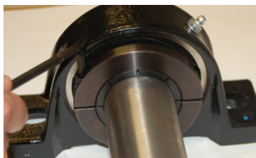
Figure 1) Set screw tightening on a Centrik-Lok bearing