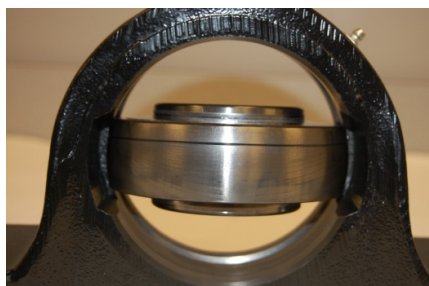
Figure 3) Loading bearing into loading slots

For UG300 only- insert the end closure tabs into the housing. Fill the gap between the end closure outer diameter and housing bore with a bead of silicone sealant/adhesive.